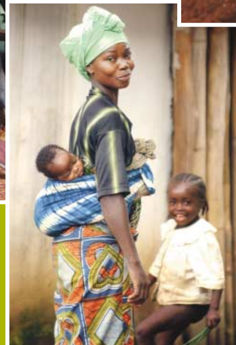
With her baby tied to her in the traditional way, a Mende woman strolls through Yoyema, Sierra Leone.